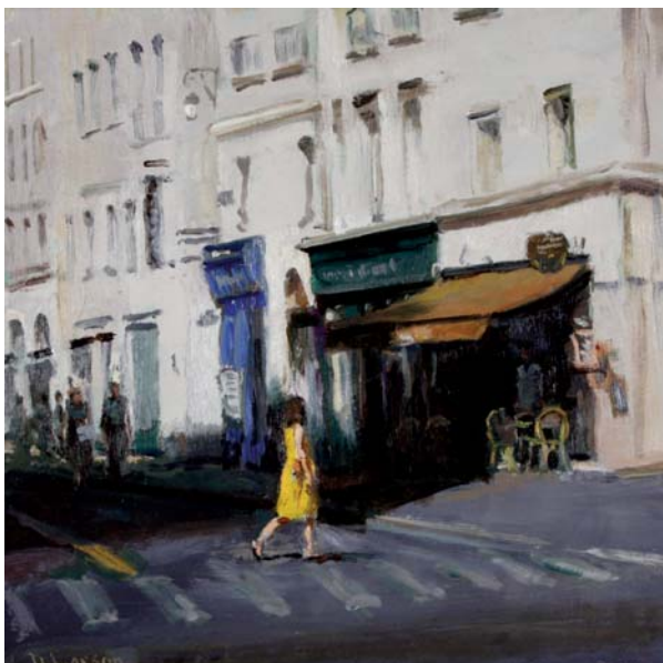
RUE DE SEVIGNE, PARIS, OIL ON PANEL, 12 X 12"