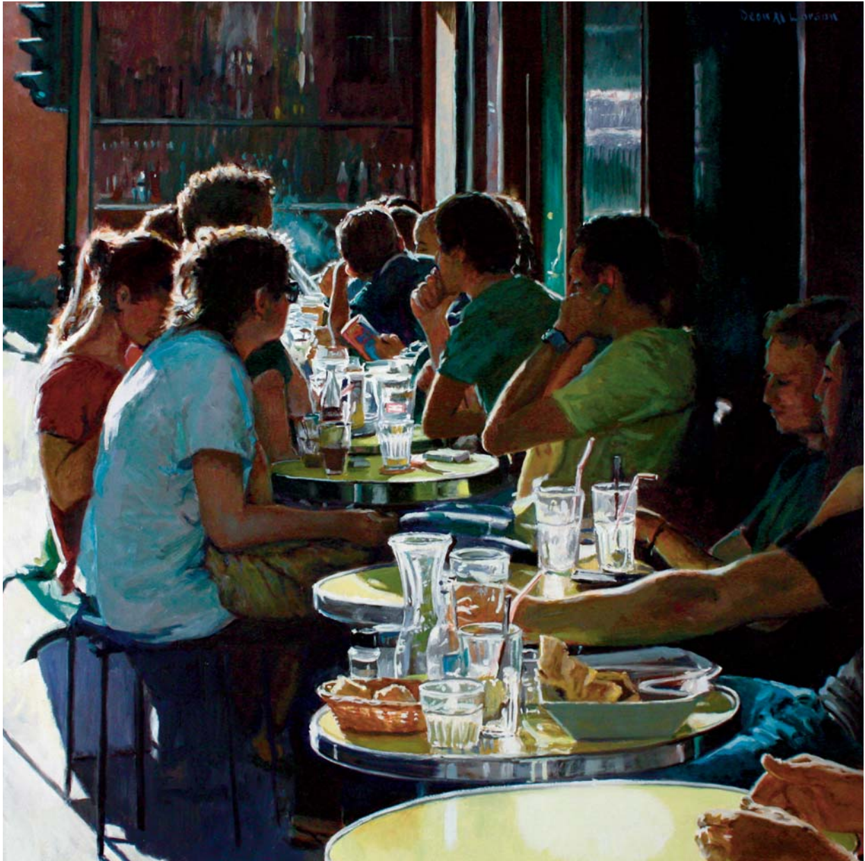
SUMMER CAFÉ, OIL ON CANVAS, 30 X 30"